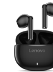
Lenovo E310 True Wireless Stereo Earbuds (Black)