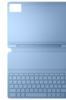
Lenovo Folio Keyboard for IdeaTab