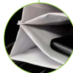
Large main compartment featuring internal dividers for better organization

* The images and illustrations are for reference only. Accessories not included