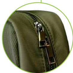
Heavy-duty metal zipper with smooth-glide pullers