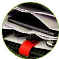
Accessory organizer with multiple pockets, carry strap, and carabiner hook