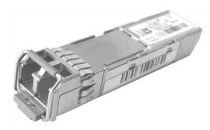
Figure 1. Cisco Optical Gigabit Ethernet SFP

The industry-standard Cisco Small Form-Factor Pluggable (SFP) Gigabit Interface Converter (Figure 1) links your switches and routers to the network. The hot-swappable input/output device plugs into a Gigabit Ethernet port or slot. Optical and copper models can be used on a wide variety of Cisco products and intermixed in combinations of 1000BASE-T, 1000BASE-SX, 1000BASE-LX/LH, 1000BASE-EX, 1000BASE-ZX, or 1000BASE-BX10-D/U on a port-by-port basis.