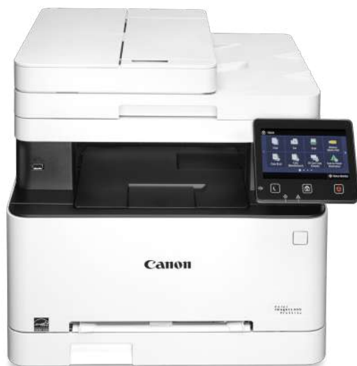
Color imageCLASS MF644Cdw (120V) Item Code: 3102C005 Canon imageCLASS MF645Cx (230V) Item Code: 3102C003